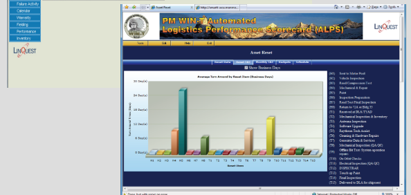
Performance-Based Logistics (PBL)