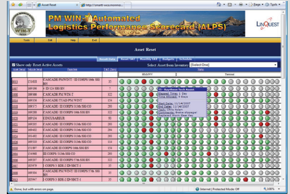
RESET and Upgrade processing